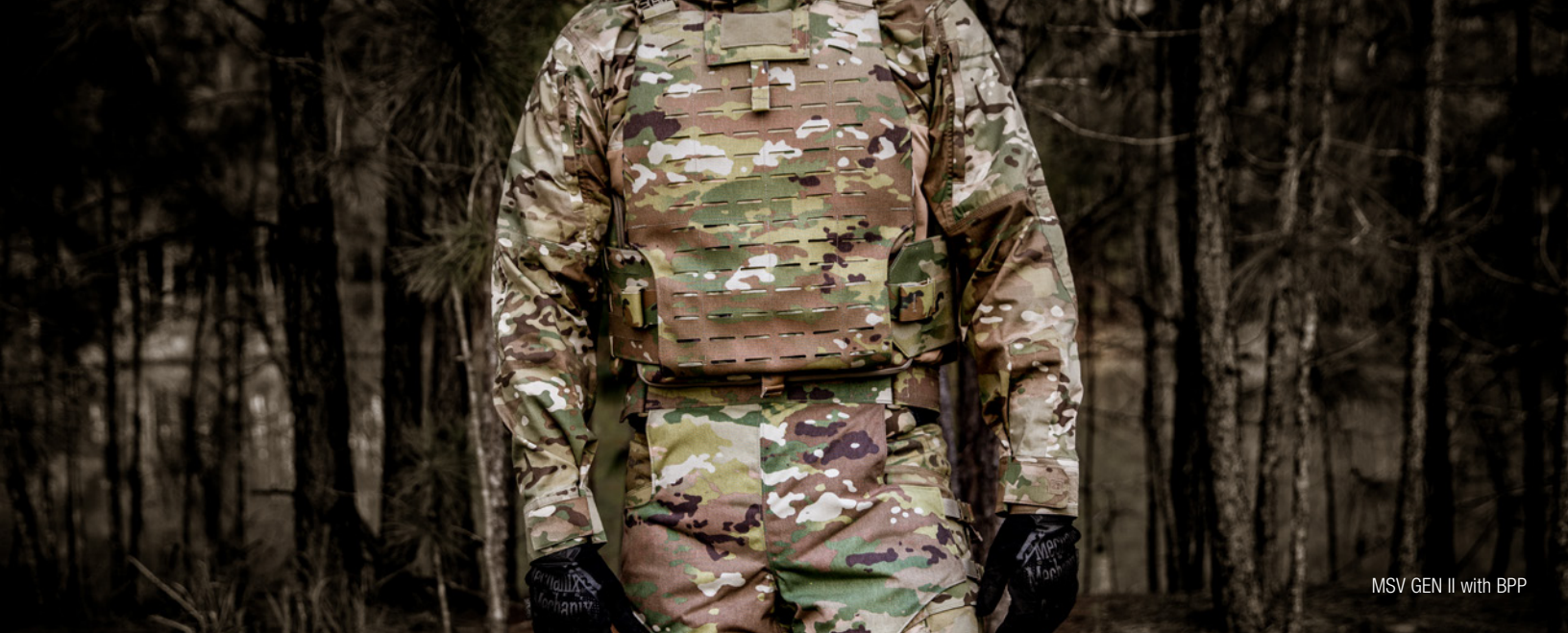
MSV GEN II with BPP