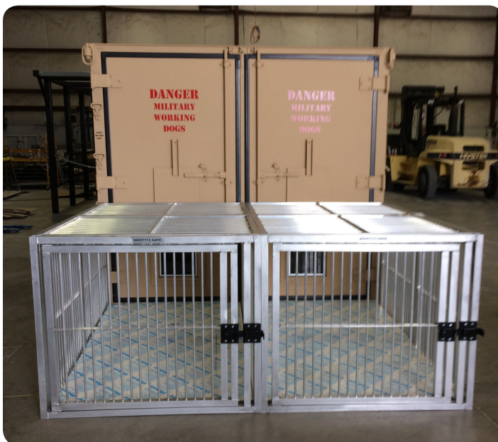
ISU® 90KCI Dog Kennel shown with 2 dog runs and matting in place