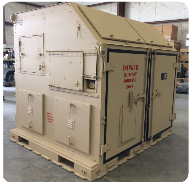
ISU® 90KCI Dog Kennel shown stowed and ready for deployment