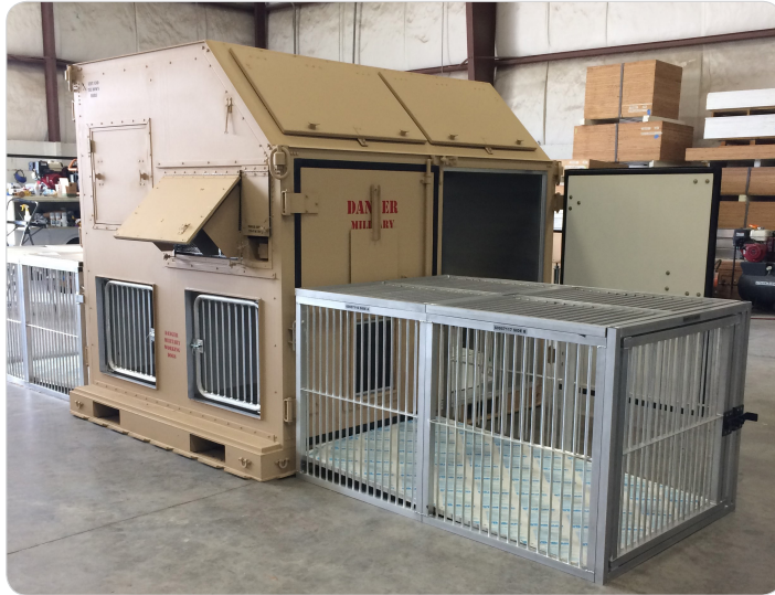
ISU® 90KCI Dog Kennel shown with dog runs and matting in place