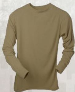
Layer II Long Sleeve Crew