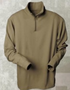
Layer IV 1/4 Zip Top

*Listed on USAF No Melt No Drip (NMND) Next-to-Skin Approved Product List