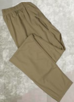
Layer III Pant with Fly