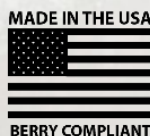
Item #: AOS PL-MCC