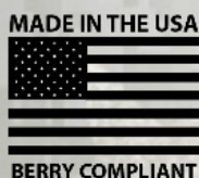
Style #: AOS6021