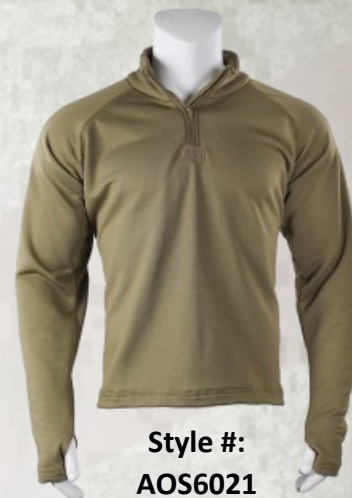
Style #: AOS6021