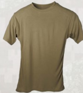
Layer I Short Sleeve Crew