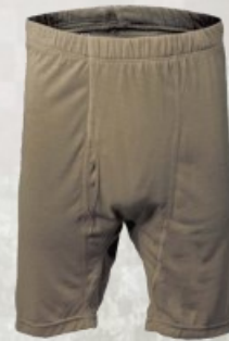
Layer I Boxer with Fly