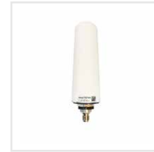
External Fixed- Mount Antenna Kit