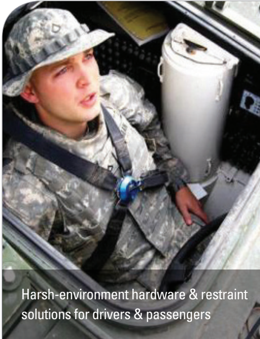
Harsh-environment hardware & restraint solutions for drivers & passengers

AmSafe products are focused on ease of use and comfort to encourage usage